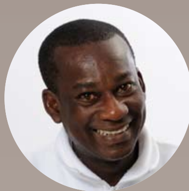
Guaranteed by Alex Obeng Packaging Department

The Twin Top ® 01 Lightly Sparkling Wine is a technical cork stopper ideal for wines with overpressure up to 2,5 bar. It is conceived for wines that need to maintain the gas resulting from the fermentation, even in difficult conditions and in markets very far away from the production site. Consisting of an agglomerated body and of a disk of natural cork at one of the two ends, it must be employed in corking lines with orientation equipment.